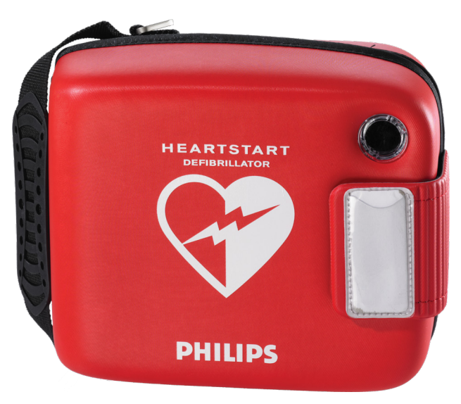
PROTECTIVE CARRY CASE